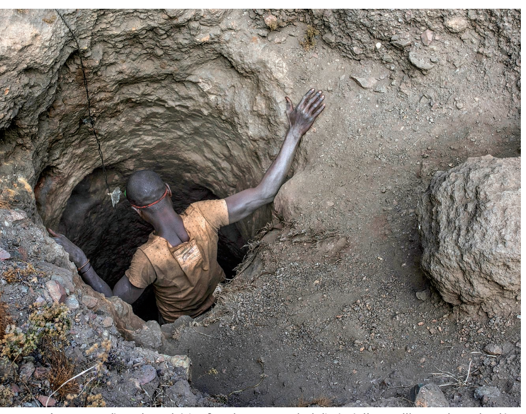
A creuseur, or digger, descends into a Congolese copper and cobalt mine in Kawama. Wages are low, and working conditions are dangerous, often with no safety equipment or structural support for the tunnels.

ability to increase productivity and mechanize production, even in hostile regulatory and governance environments. More space for and support to ASM to pursue this trajectory would enhance its capacity to meet the increased demand for minerals required in the move toward a low-carbon future. One place to begin is with the redistribution of dormant mining concessions previously granted to (but unused by) mining companies so that local ASM operators can legally work in these locations, as has been taking place recently in Tanzania.